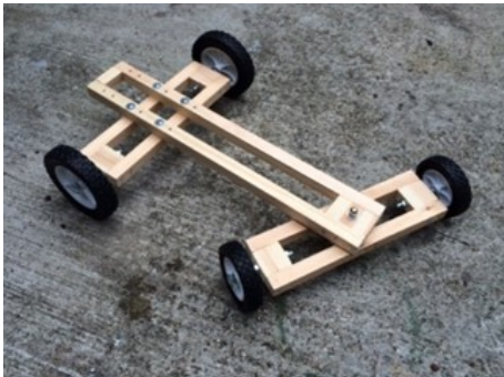
Stage 1 – the basic chassis is constructed and the wheels fitted