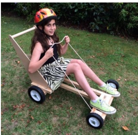
Stage 3 – helmet on and ready to roll!

Design Education CIC is a non-profit community interest company. Our mission is to support the next generation of designers and makers. To find out more, visit our web site at www.designeducation.org.uk or email us at info@designeducation.org.uk