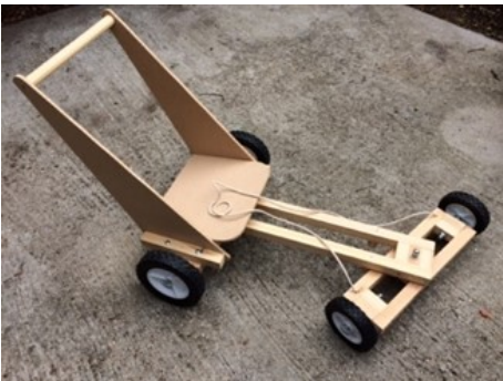
Stage 2 – the seat and crash bar/ pushing rail is fitted, as well as the steering rope